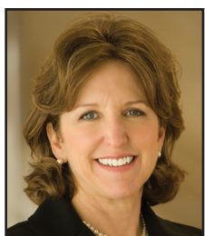
Kay Hagan US Senate Senate Banking Committee Member